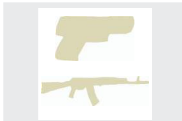
Hand Guns and Rifles