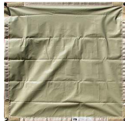
Tan Front Panel